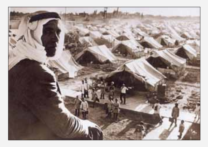
Palestinian refugees at the Jaramana Refugee Camp, Damascus, 1948

Prior to the civil war in 2011, Syria was generally perceived to provide the best conditions for Palestinian refugees among Middle Eastern countries. It hosted the second largest Palestinian Diaspora community, made up mainly of 1948 refugees from the northern cities of Palestine, such as Safad, Haifa, and the Galilee, as well as 1967 refugees from the Golan Heights. Today, there are some 546,646 Palestinian refugees in Syria, of which 30% live in one of the 10 UNRWA camps.<sup>30</sup> The legal status of Palestinian refugees is regulated by the Syrian Arab Republic Law No. 260 of 1957, which gives them the same duties and responsibilities as Syrian citizens, with the exception of the right to vote, hold office, and possess Syrian passports (the latter in order to preserve their Palestinian identity/nationality). Instead, they hold travel documents, although these are not recognized by many governments and their freedom of movement is, therefore, limited. Other than this, Palestinians are widely