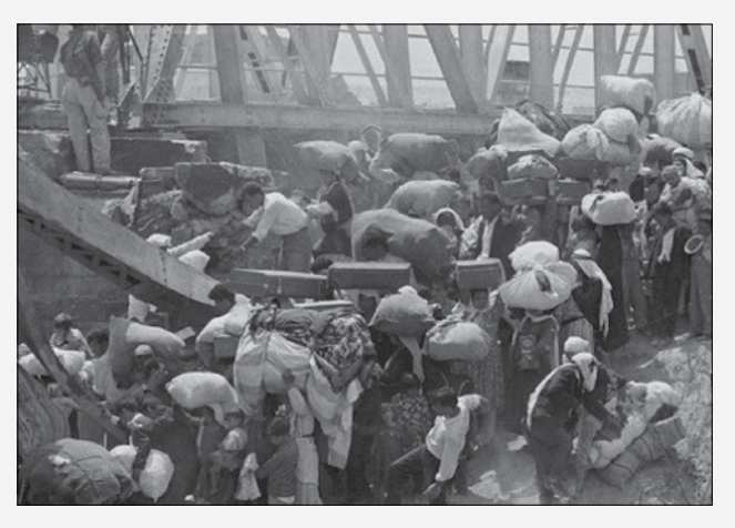
Palestinian refugees crossing Allenby Bridge into Jordan, 1967.

Today, Palestinians in Jordan make up 60% of the population and include 2,133,756 UNRWA-registered refugees, only 18% of which live in camps.<sup>27</sup> The 1954 Nationalities Act stated that: "Any person with previous Palestinian nationality except the Jews before the date of May 14, 1948 residing in the Kingdom during the period from December 20, 1949 and February 16, 1954 is a Jordanian citizen". These refugees have been granted citizenship and in October 1995, most Palestinian refugees became eligible to receive five-year passports, although the government stressed that these were for travel only and did not denote nationality.