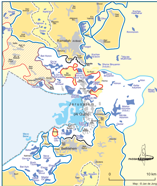
Walls around Israeli 'Greater' Jerusalem - December 2003

The fourth and final part of the agenda comprises, a Palestine Chronology 2003 , a full list of PASSIA publications , as well as a selection of colored maps , including one on Israeli settlement policy in the West Bank and several of the separation wall .